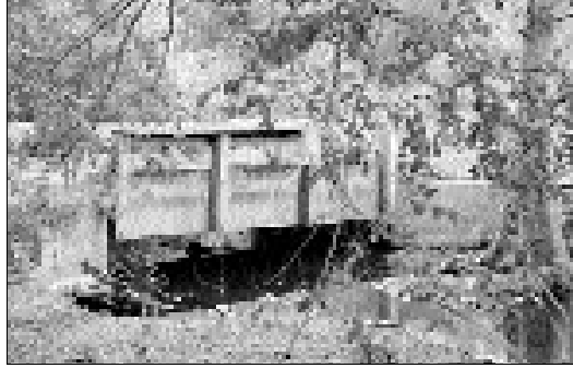
Redwood Creek's natural flow is constricted by several man-made structures, including this bridge on Pacific Way.

Suddenly this summer, without consultation with any environmental or fisheries groups, GGNRA announced a plan to use a bulldozer to deepen a 1100-foot stretch of the creek. GGNRA claims that this flood control project will also benefit the fish, but the bulldozing may result in the destruction of hundreds of coho, a significant portion of the creek's population.