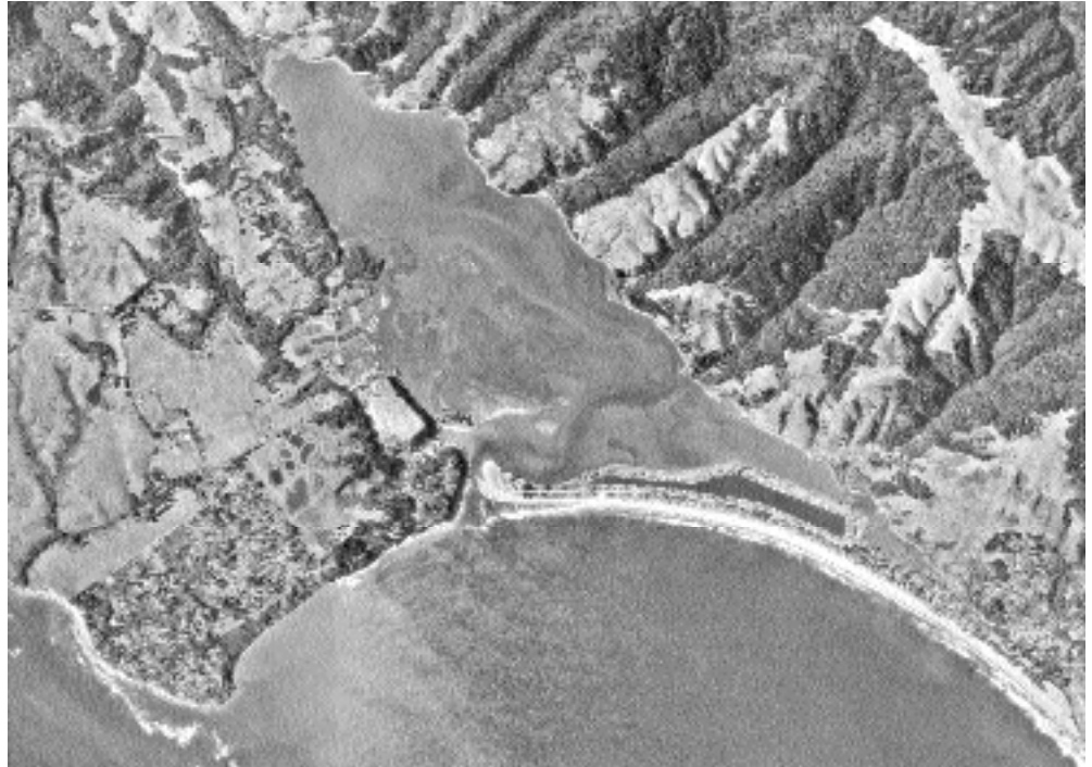
An aerial view of Bolinas Lagoon.

Though the plan is presented as a restoration project, the Draft EIS provides no evidence that Bolinas Lagoon needs to be restored. It is one of the most unspoiled and productive wetlands in the United States and is the only site on the West Coast to be recognized as internationally important